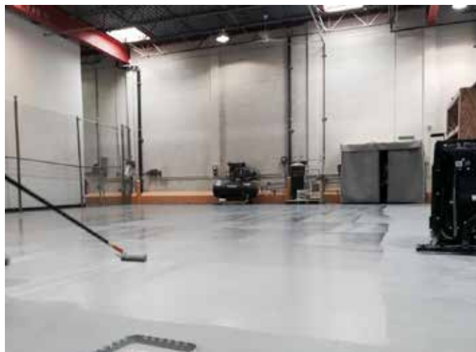
Belzona 5233 can be easily hand-applied by brush or roller

This solvent-free system is easy to mix and apply by roller, without the need for hot work.