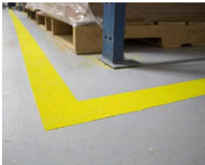
Used as a clear topcoat over Belzona 5231 and aggregate

For more information, please contact your local Belzona representative: